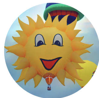
You Are My Sunshine