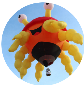
Claw'd The Crazy Crab

Special Shape Balloons will be relayed to Sponsors as they are confirmed for the 2024 Festival. Below, are a few Special Shape Balloons that we have had the honor of hosting at Carolina BalloonFest in previous years!