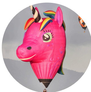
Allycorn The Pink Unicorn